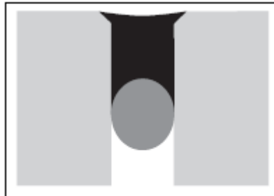
Flush joint design prevents trip hazards and dirt traps

Backing: Use closed cell, polyethylene foam backing rods.